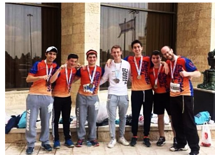
2016 TABC Team Yachad Runners

It's coming up quickly! The Jerusalem Marathon is only three weeks away on March 17! Click here to support the TABC students running for Team Yachad!